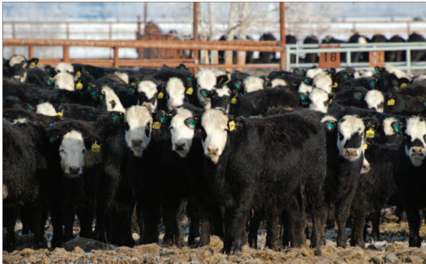
A 4,300-head closed feedlot located at Hysham, Mont., allows the Bormans to background their black baldie calves for 45 to 60 days before delivering them to buyers.